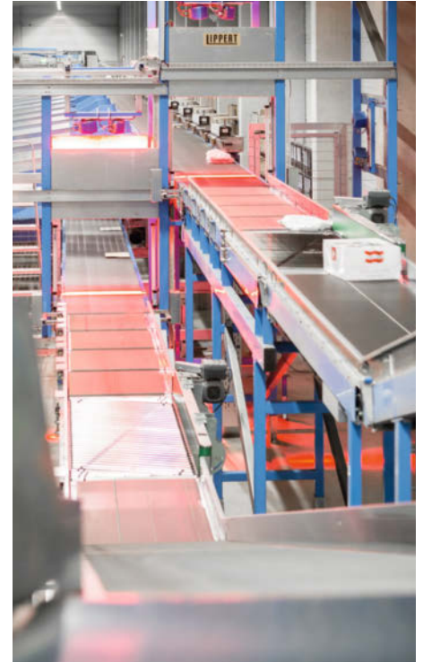
Identification and optional volume/weight measurement

easily accessible. All of the above helps ensure high availability and low maintenance costs.