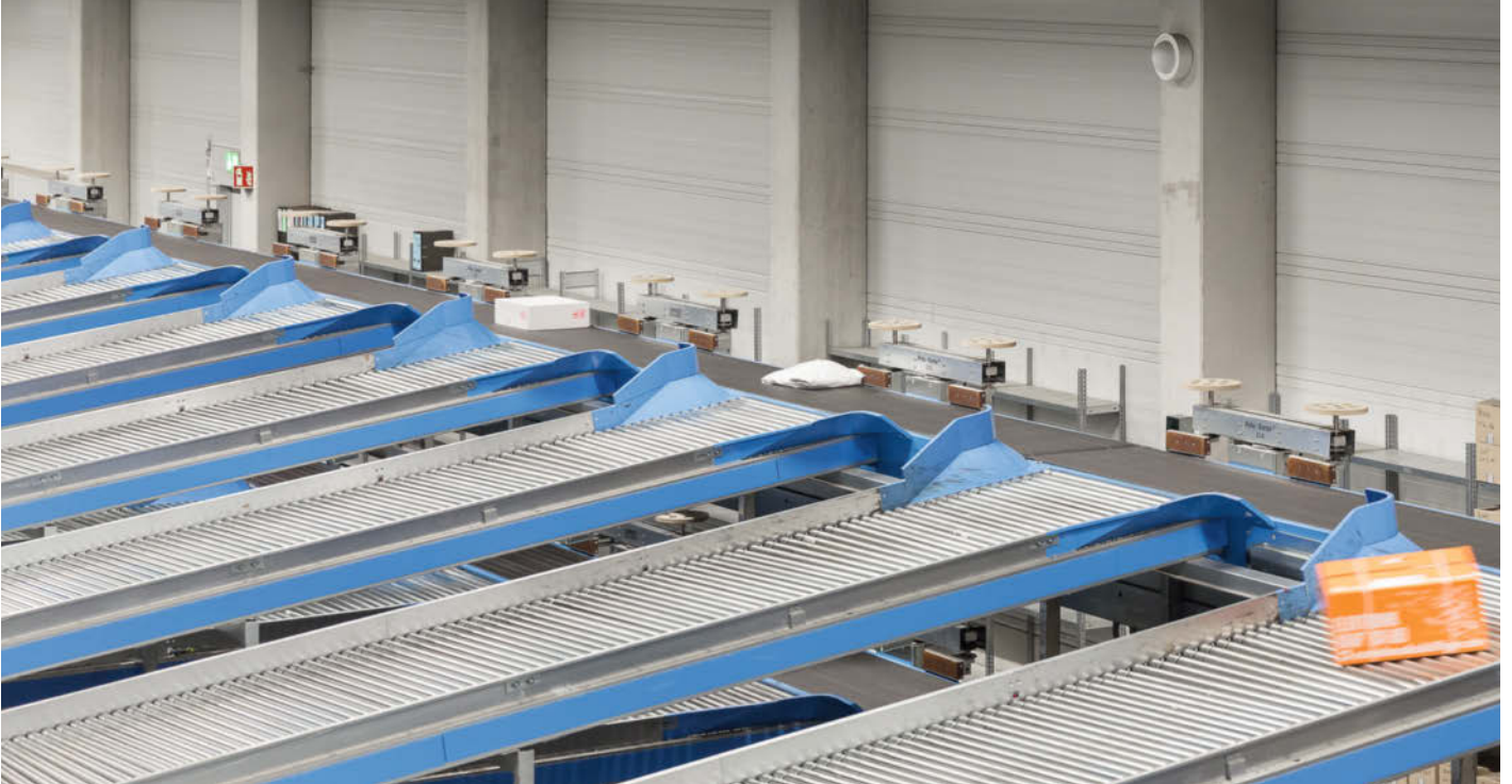
Sortation of various items on one sorter – polybags or parcels

With the latest solution by BEUMER, you opt for a versatile machine with superior operational efficiency: the Rota-Sorter® can handle a vast range of items on a single line at top speed. Its unique discharge technology makes sortation extremely gentle. The system also distinguishes itself through its flexibility and economic efficiency.