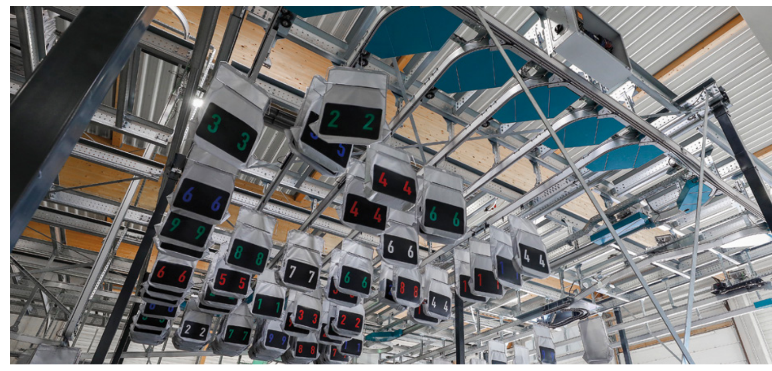
From random to perfect order in three steps

Each standard BG Pouch System module can be configured to provide minimal touch for buffering, sorting, sequencing and returns handling within a single system.