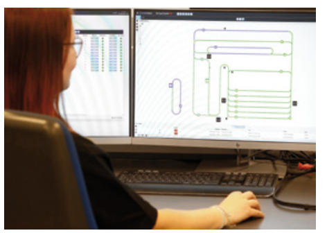
Gentle handling and complete system overview - also in when moving between heights

To ensure fast installation and minimise maintenance, the overhead BG Pouch System combines simplicity with a lean and modular build and is designed to use the height of the building.