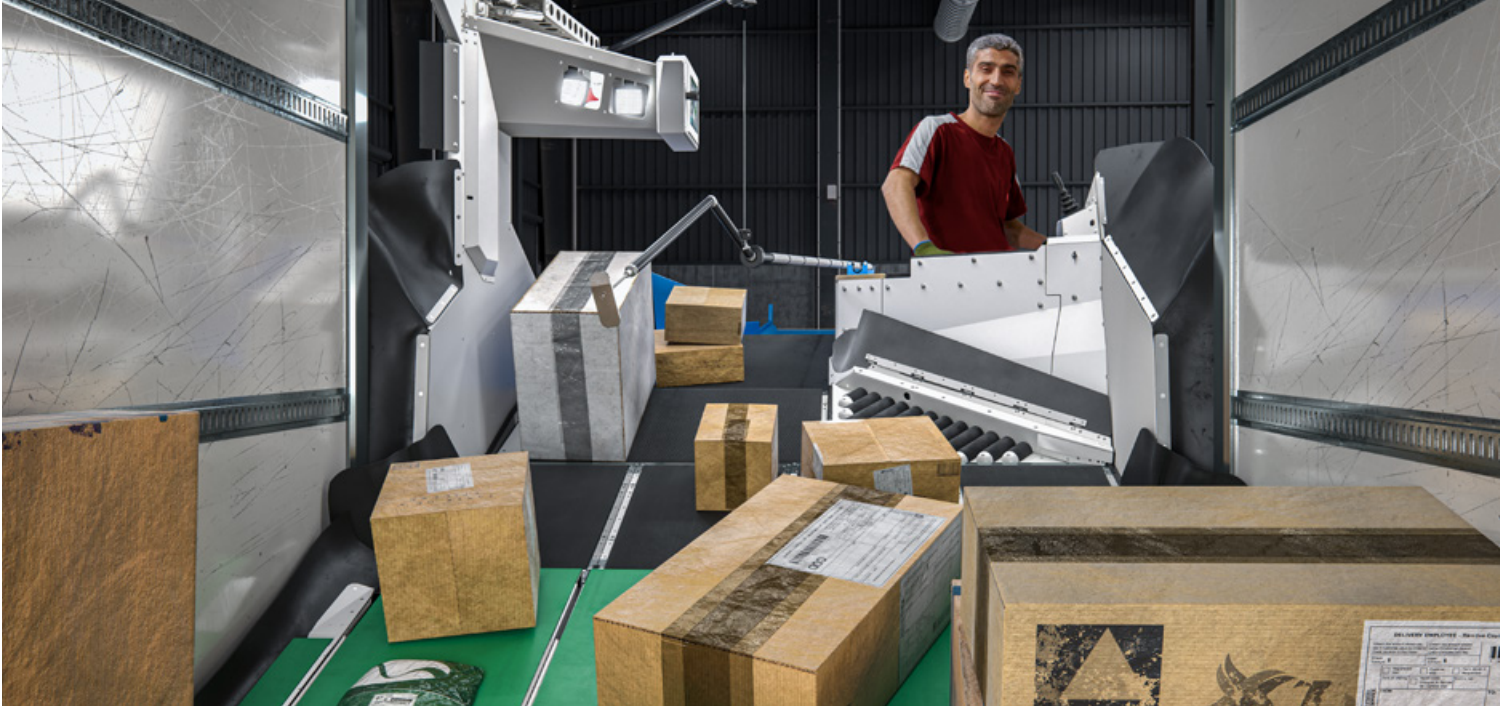
Semi-automated and smooth handling of inbound parcels

A throughput which more than doubles the manual unloading rate can be achieved by a trained operator unloading a typical parcel mix with the Parcel Picker.