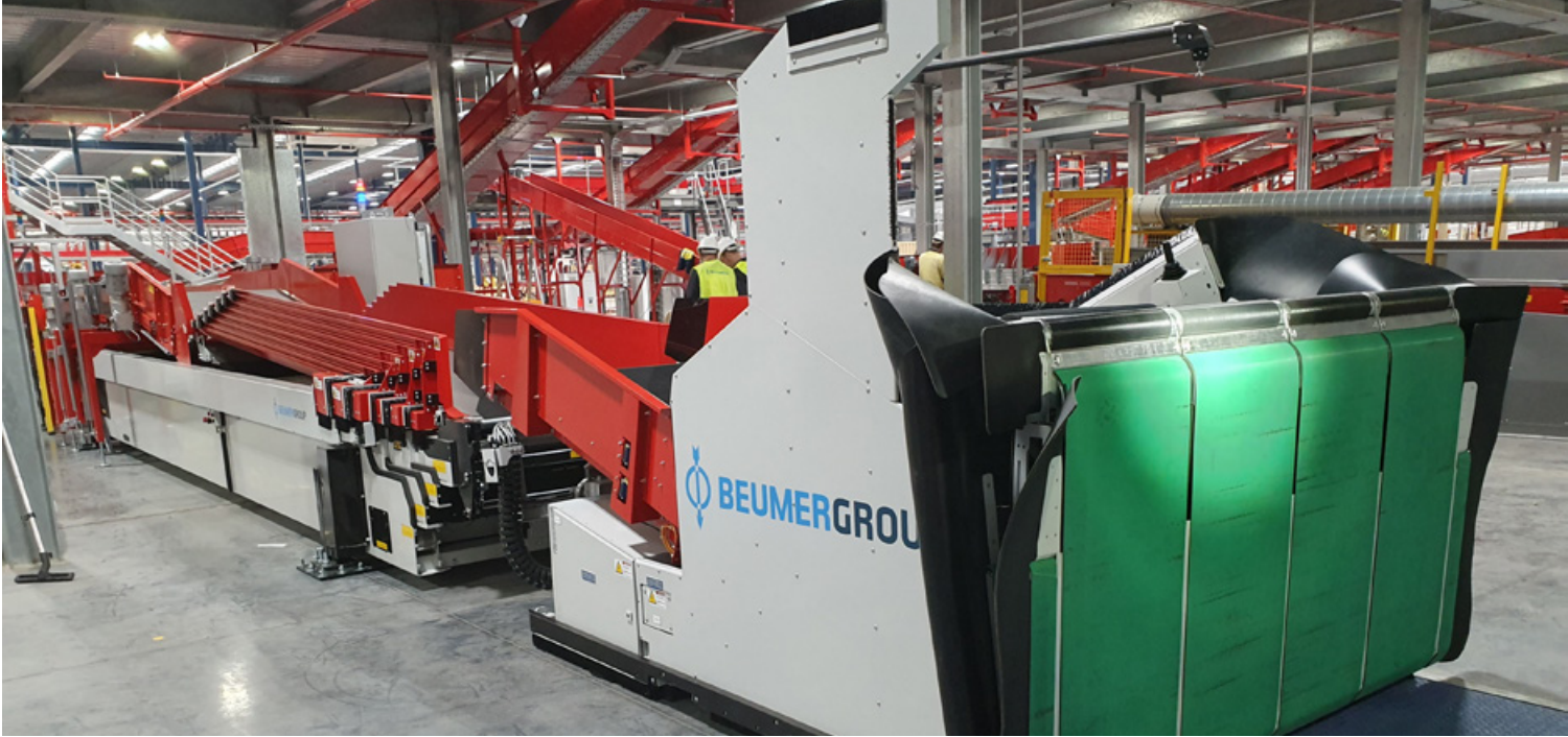
Fully integrated with sortation system

Integrating the BEUMER Parcel Picker with an automated singulation system delivers additional value and efficiency by optimising the parcel flow for the full inbound process.