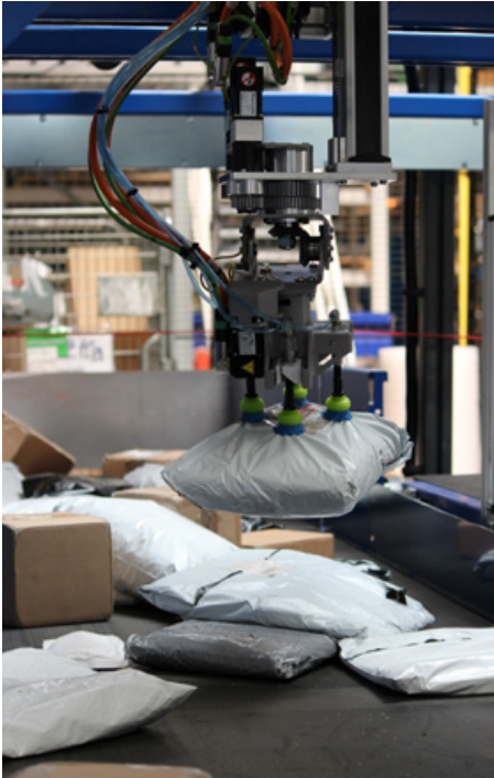
Integrating with an automated singulation system