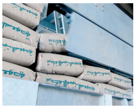
Loading a double pattern of five bags

The fully automated BEUMER autopac<sup>®</sup> efficiently handles two tasks at once: Loading and palletising of bagged material. For decades BEUMER has been a pioneer in this field with its three-dimensionally adjustable bag loading machines with telescopic heads for truck and railcar loading. So relying on BEUMER means relying on experience, innovation and the confidence of a strong partnership.