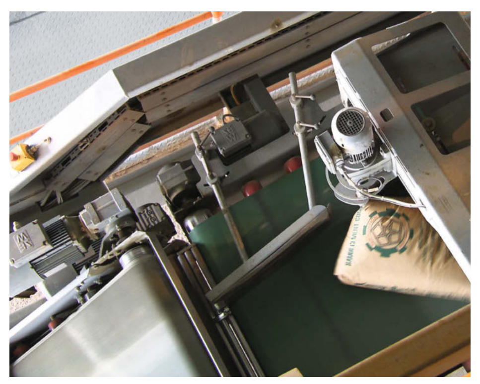
The bar-type turning device – as seen here in a BEUMER autopac<sup>®</sup> 3000 at Saudi Cement Company, Hofuf, Saudi Arabia – arranges the bags according to the chosen pattern.