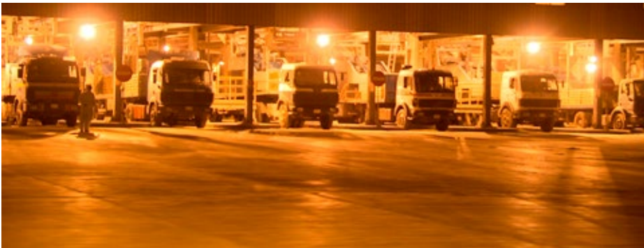
With layer calibration performed directly on the truck, the evenly piled bags ensure safe transport.

Depending on the bag size and aspect ratio, the machine can load bags in double patterns of five, six, and ten bags per layer. With a height to the ceiling of five metres, the maximum loading height is 3.5 metres. Gentle bag handling for various types of bag material – for example, paper and HDPE bags – is achieved through a very low positioning height. The bags are supported throughout the loading process instead of being lifted and potentially deformed, for example, by suction modules.