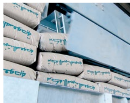
Loading a double pattern of five bags

The fully automated BEUMER autopac® efficiently handles two tasks at once: Loading and palletising of bagged material. For decades BEUMER has been a pioneer in this field with its three-dimensionally adjustable bag loading machines with telescopic heads for truck and railcar loading. So relying on BEUMER means relying on experience, innovation and the confidence of a strong partnership.