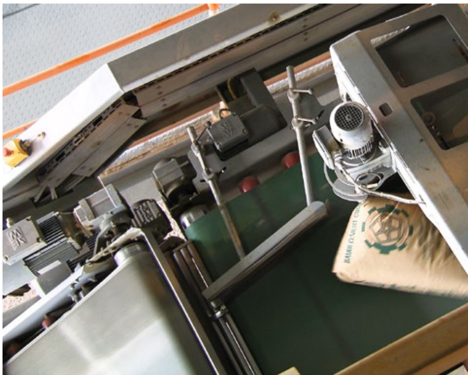
The bar-type turning device – as seen here in a BEUMER autopac® 3000 at Saudi Cement Company, Hofuf, Saudi Arabia – arranges the bags according to the chosen pattern.