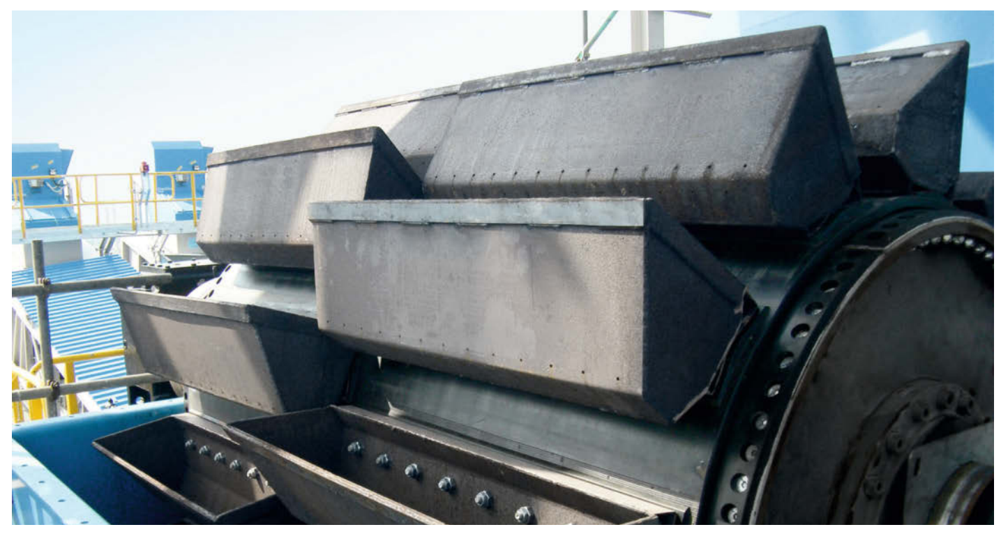
BEUMER heavy-duty belt bucket elevator, Tuas Power, Singapore

Heavy-duty systems are needed particularly when rocks and soil have to be transported. The BEUMER heavy-duty belt bucket elevators are perfectly suited for use in the cement and mining industries and in power stations.