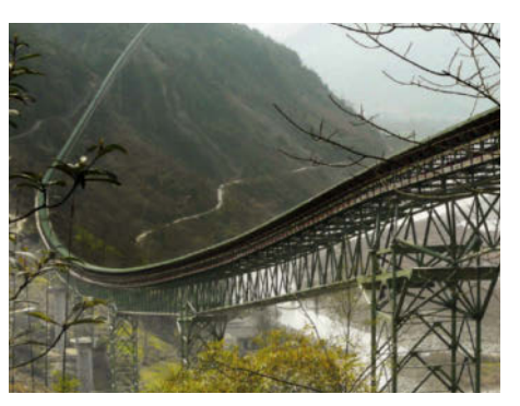
BEUMER troughed belt conveyor, Asia Cement Group, Sichuan, China

Trucks and trains rapidly reach their limits on difficult terrain or when transport volumes build up. The highly flexible BEUMER belt conveyors are a better means of transport in such cases – both from an environmental perspective, thanks to energy recovery systems and low CO<sub>2</sub> emissions, and economically, because of the low investment and operating costs involved.