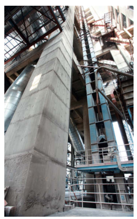
BEUMER high-capacity belt bucket elevators

Whether hot or cold: BEUMER bucket elevators are the economical solution when it comes to vertically transporting bulk goods. As the market leader, the BEUMER Group has developed more and more highly refined technical designs for this type of conveying system for a number of decades now. Therefore the BEUMER Group can offer the perfect configuration for many different potential application scenarios.