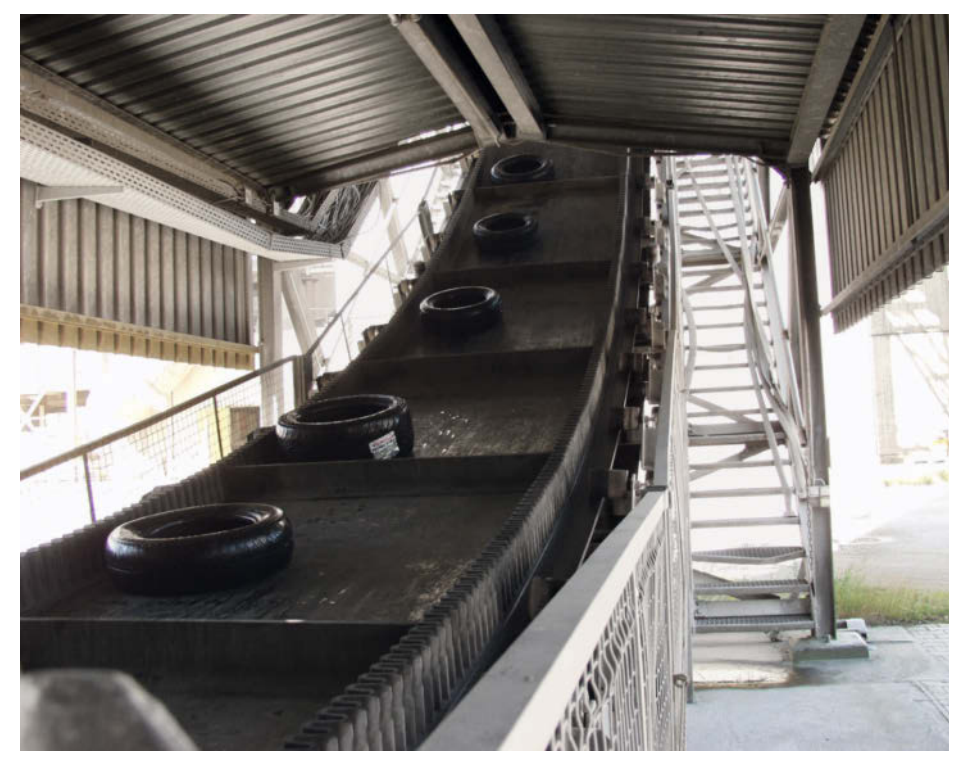
System technology for the transport of used tyres

Constantly increasing energy costs are making alternative fuels more and more appealing for more than just energy-intensive sectors such as the cement industry. The BEUMER Group has been observing this trend for almost 30 years. It has developed system solutions that recover energy from waste and secondary fuels in a way that is economical and environmentally friendly.