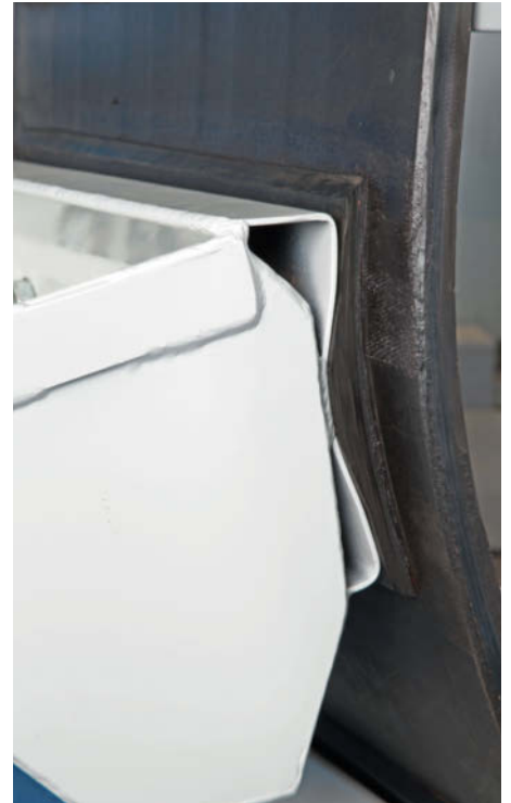
Optimised bucket design for minimum wear and long service life