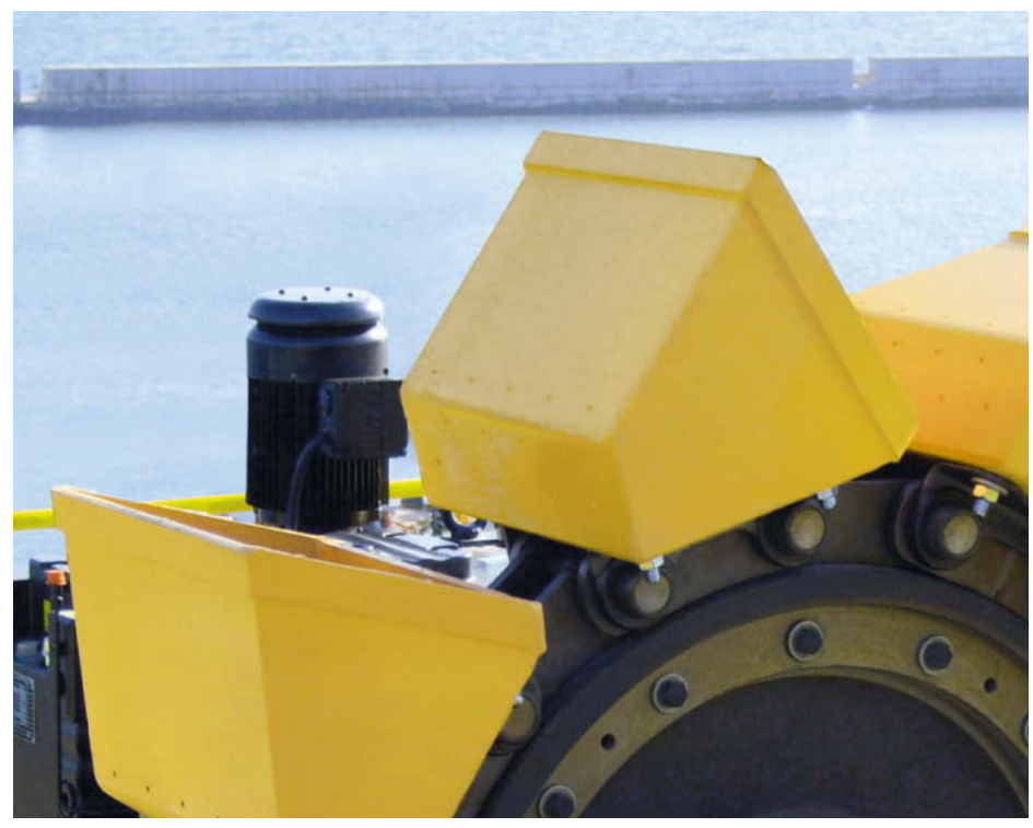
BEUMER central chain bucket elevator