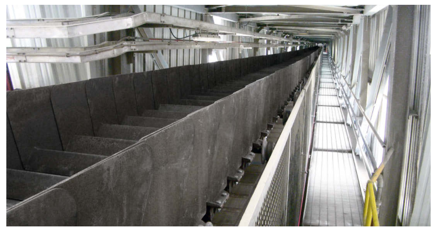
BEUMER bucket/belt conveyor